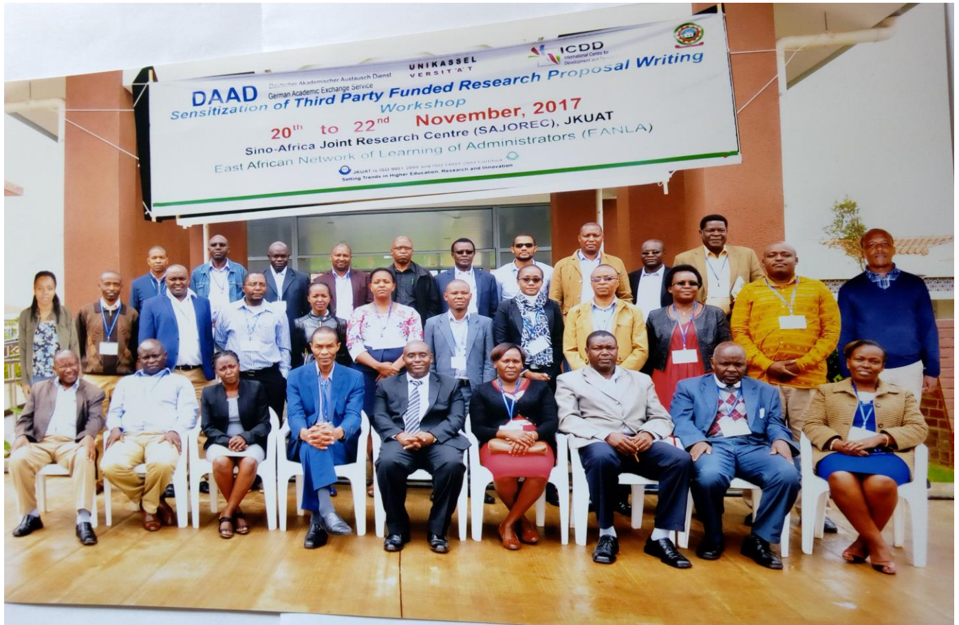
Figure 1: Group photo of the workshop participants

Workshop participants were Principal investigators and finance administrators from public and private Universities. Other invited participants included a team from the KEMRI and representative from government ministries. Universities represented at the workshop included Zetech, UON, Meru, Egerton, Makerere, USIU, JKUAT, and MMUST